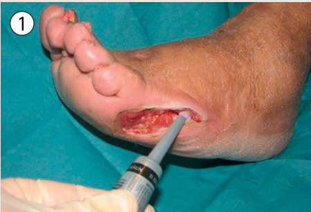
Apply the paste in the wound.