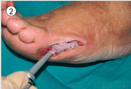
Cover the whole wound bed.