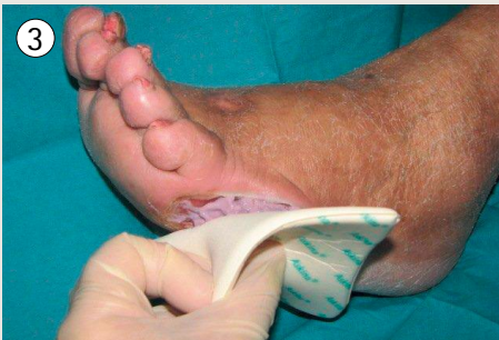
Cover with a secondary dressing