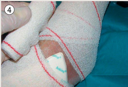
If necessary, fix with bandage or tape