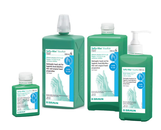
Softa-Man® and Softa-Man® ViscoRub