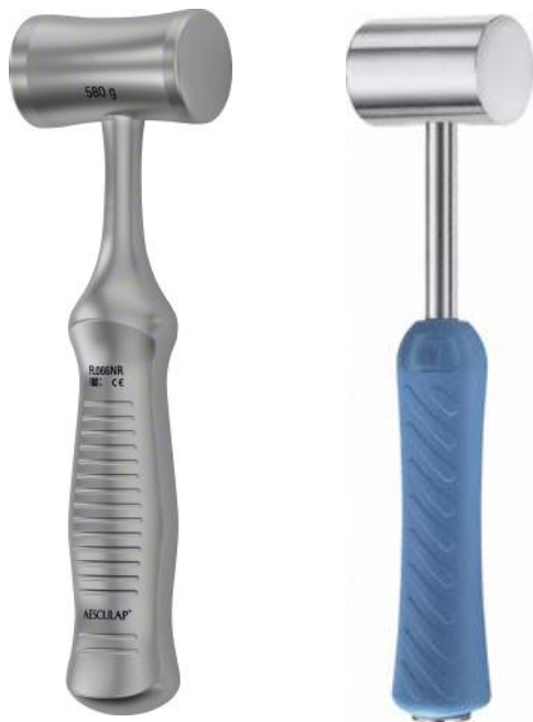
Aesculap® SQ.line® Aesculap® Silicone Version

Comparison SQ.line® mallet vs. Aesculap® silicone version